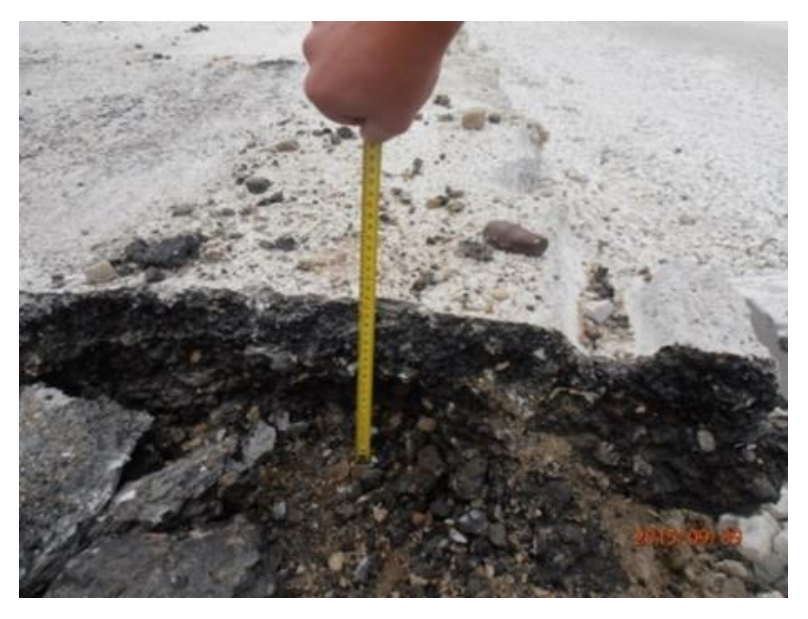
Figure 4. Full-Depth demolition of asphalt thickness 15 to 30 cm