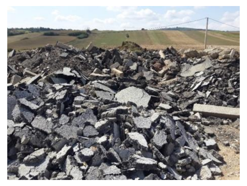
Figure 3. Full-Depth Demolition