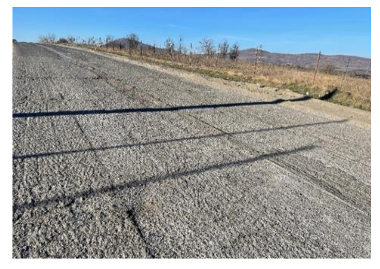
Figure 6. Asphalt erosion on the roads that will be replaced with the final 5 cm layer