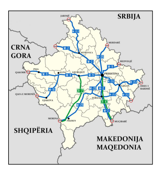
Figure 1. Infrastructure of Kosovo

Two major routes (6 and 7) connecting the area with EU transit through Kosovo are part of a larger Southeast European core network (Figure 1) [3, 9].