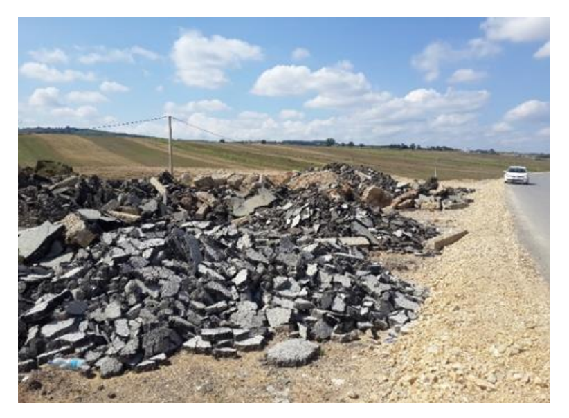
Figure 5. Full-Depth Demolition of asphalt thickness 15 to 30 cm