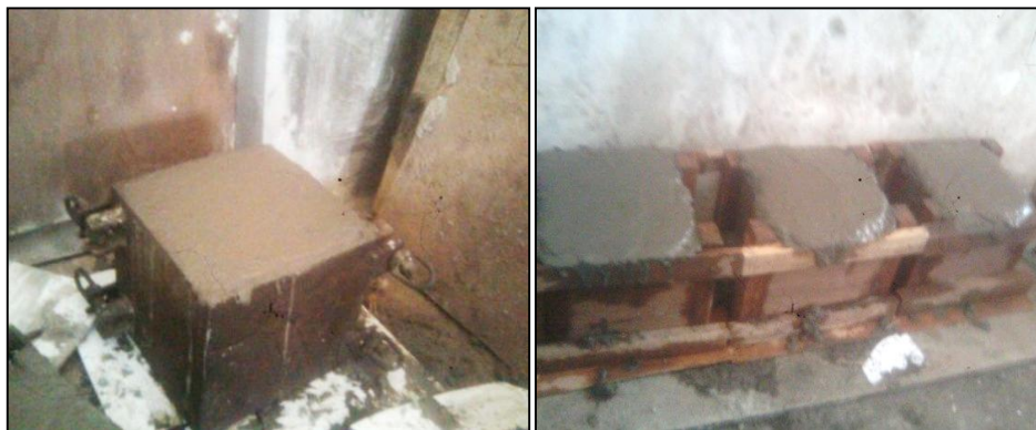
Figure 1. Marine Concrete Making Process

The design of concrete mix according to ACI (American Concrete Institute) ACI 211. 1-91 suggests a way of designing the mixture which shows the economic value, the available materials, workability, durability and the desired strength. The way ACI sees the fact that at a certain maximum aggregate size and the amount of water per cubic meter the mortar determines the level of consistency or the slump of the concrete. Broadly speaking, the concrete mix concrete planning step is as follows: