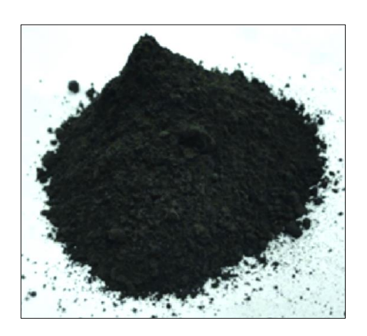
Figure 3. Grinded POFA