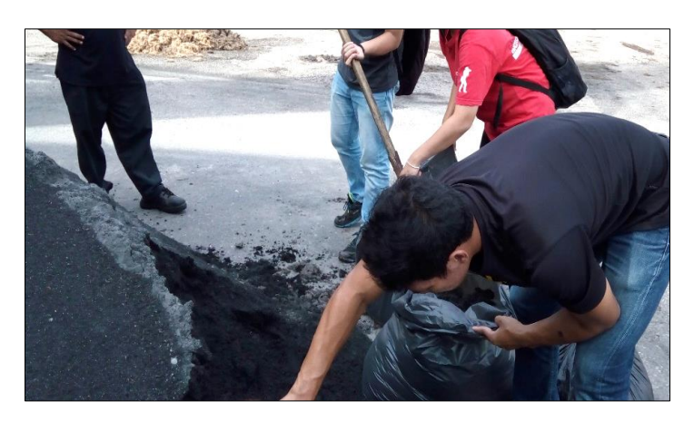
Figure 2. POFA in open air