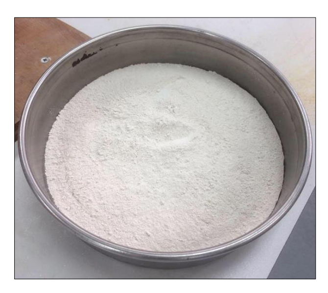
Figure 1. Finely grinded ESP