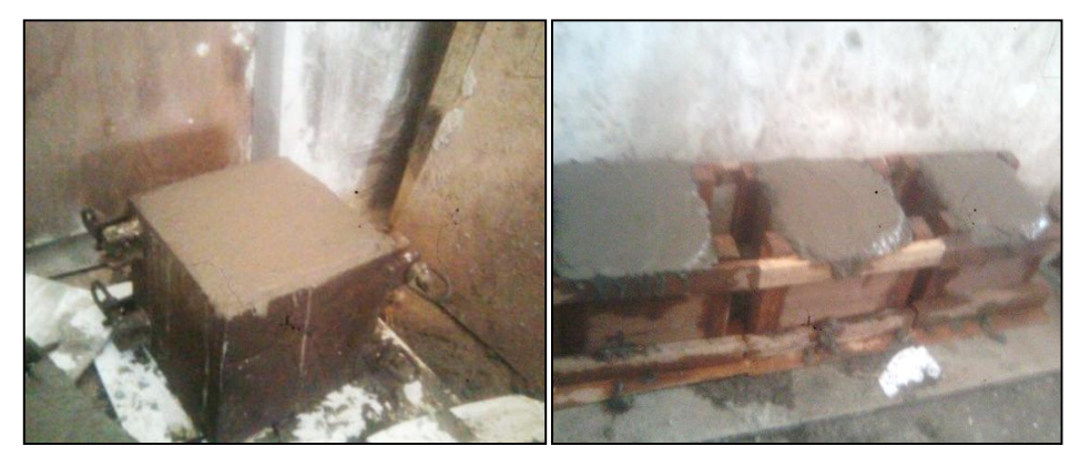
Figure 1. Marine Concrete Making Process

The design of concrete mix according to ACI (American Concrete Institute) ACI 211. 1-91 suggests a way of designing the mixture which shows the economic value, the available materials, workability, durability and the desired strength. The way ACI sees the fact that at a certain maximum aggregate size and the amount of water per cubic meter the mortar determines the level of consistency or the slump of the concrete. Broadly speaking, the concrete mix concrete planning step is as follows: